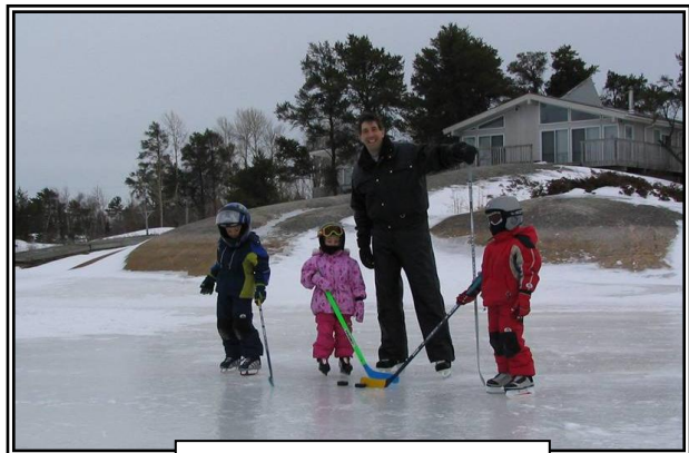
May 24 th Weekend??